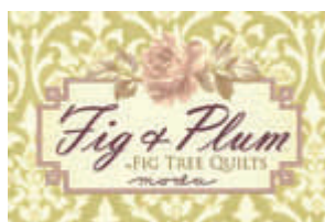
Fig & Plum Recess Odelia Rose Garden Tea for Two

Soirée Butterfly Fling Cotton Blossoms Flirt