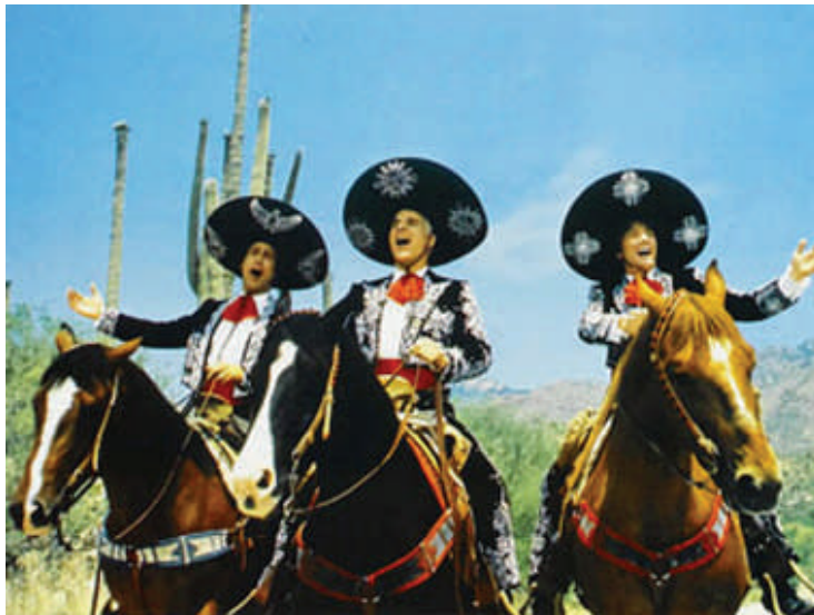
Chevy Chase, Steve Martin and Martin Short in The Three Amigos (1986)

Sombreros are made from a variety of materials, but the most common are straw, used primarily for peasants and farmers, and felt for the wealthier classes, often with velvet lining as well. Most sombreros come with a chinstrap to keep it in place, and the more elaborate ones are sometimes decorated with hanging wooden beads. It's during the famous Mexican Hat Dance (Jarabe Tapatio), that these beads really come into their own, giving the hat life and movement as the man cavorts deliriously around the woman before finally throwing the sombrero at her feet. Just imagine trying to do that with a plain old bowler or trilby.