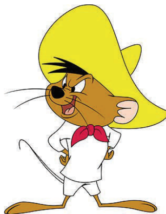
Speedy Gonzales – "the fastest mouse in all Meck-icko"

But what about that fabulously cool name? Let's all say it together now... som-brear-roh. The word has Spanish origins, not surprisingly, basically meaning any hat with a brim. It's derived from yet another Spanish word, 'sombra', which means shade or shadow. You don't have to be a genius to see how the name came to be applied to these extra-wide-brimmed hats. When outside of Mexico, Spanish-speaking folk refer to the sombrero as the "sombrero Mexicano" (Mexican hat), possibly to avoid confusion with Spain's flat-crowned Sombrero Cor-dobés, named after the city in which it's manufactured.