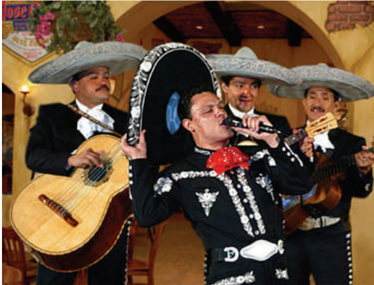
Sombrero wearers; a quartet of mariachi musicians in full flight

Grab the Tequila, and your brightest-coloured poncho because this week we're off to sunny Mexico to check out the origins, customs and mysteries of that most iconic item of Mexican headwear – the Sombrero.